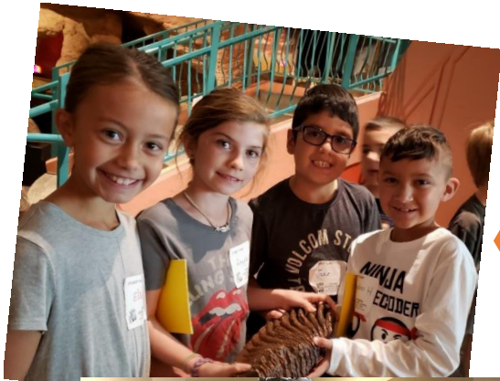
The students held a mammoth tooth fossil!