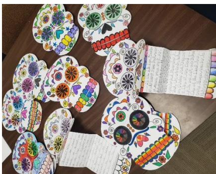
6th graders wrote spooky stories and read them aloud to their classmates.