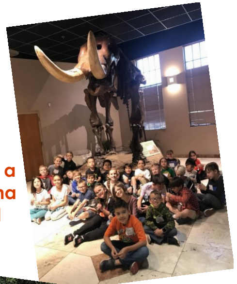
3rd graders enjoyed a field trip to the Arizona Museum of Natural History in Mesa.